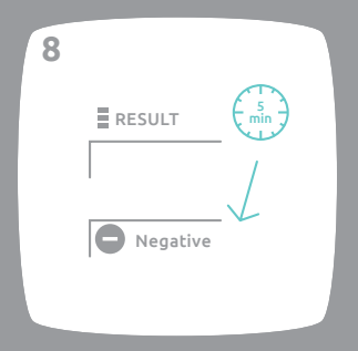
8. Read the test result from the screen