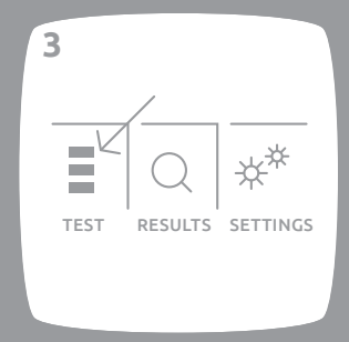
3. & 4. Prepare the instrument.